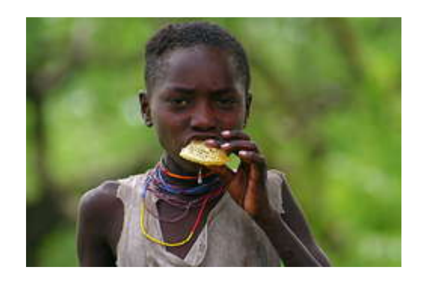
HADZA BOY EATING A FRESH HONEYCOMB, YAEDA CHINI, TANZANIA.

A couple of years ago, I sat with a group of Hadza hunters on a rocky outcrop in the bushland of north-west Tanzania, and listened to them talk about their homeland.