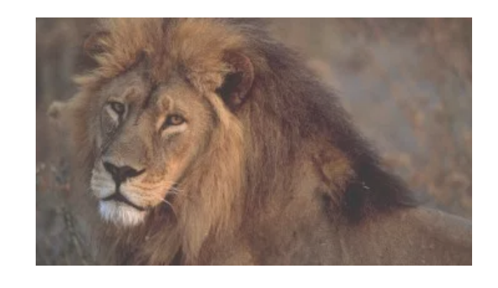
OPINION: Botswana's Hunting Ban Deserves Better from the New York Times

A year ago, a male lion called Cecil was killed in Hwange National Park, Zimbabwe, by an American trophy hunter. Cecil's death caused uproar