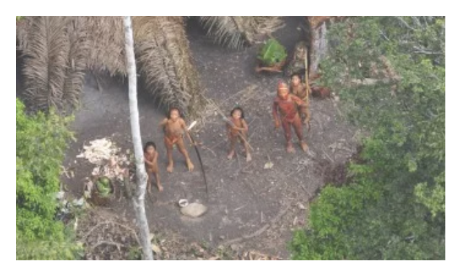
Uncontacted Tribes: The Last Free People on Earth